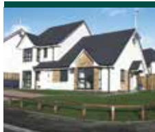
Housing Association & Affordable Homes