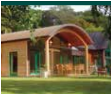
Self Build Developments